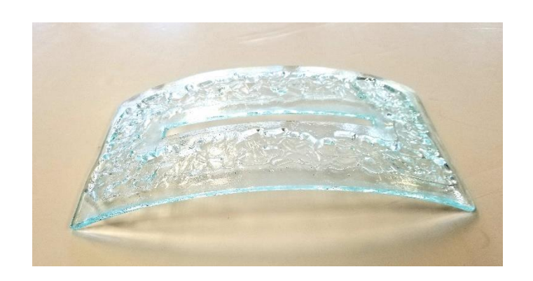
Double layer full fused with embossed texture.