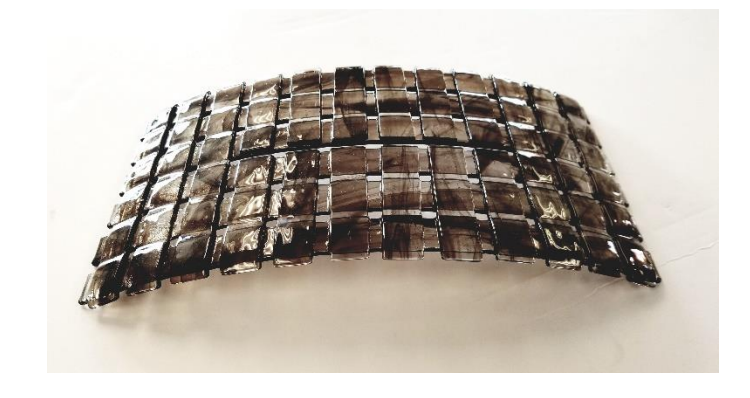
Single layer tack fused lattice grid.